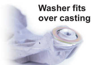
Washer fits over casting

B Bush Outside of car (Original domed washer goes here)